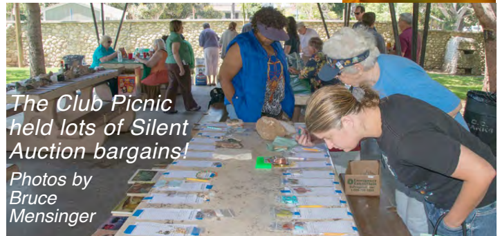
The Club Picnic held lots of Silent Auction bargains!