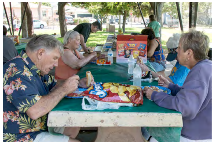
Picnic photos by Bruce Mensinger