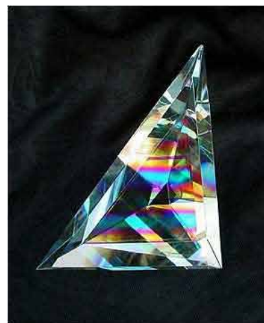
Right Angle Piece; Faceted Dichroic Glass. Private collection.