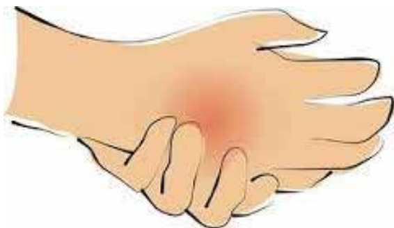
Think safety: care for one of your most important tools