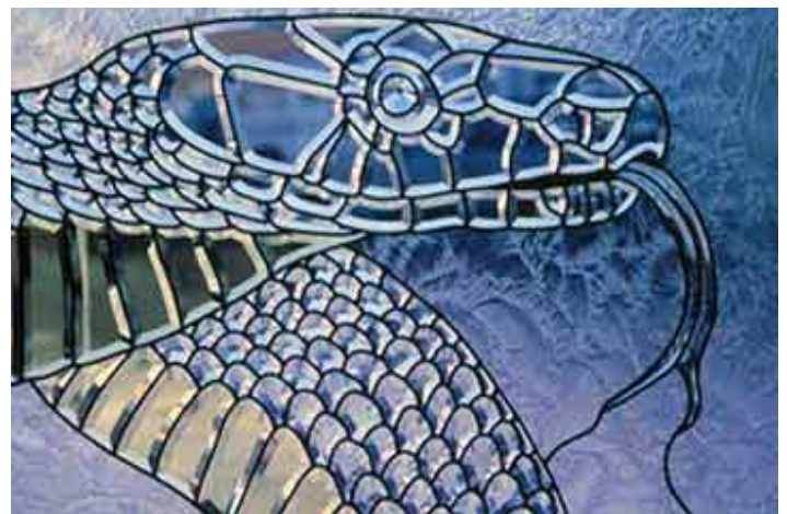
Snake in the Glass by Kent Lauer. A beveled glass creation inspired by a photo of a mamba. Collection of the artist.