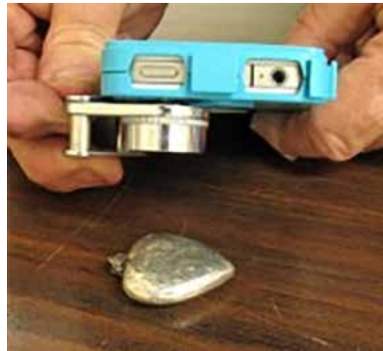
Camera with loupe for crisp, sharp close-ups

Often when trying to get a close-up photo with your iPhone or Android, you end up with a fuzzy, out-of-focus image. Next time try using your loupe over the camera lens. It works quickly and easily.