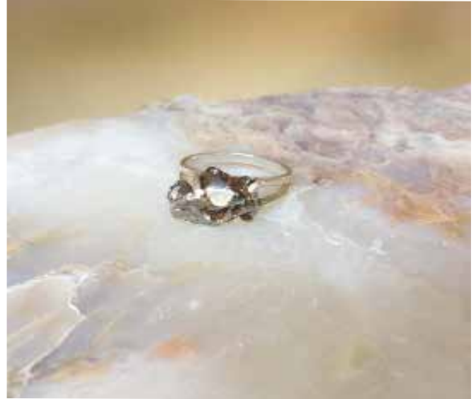
This ring contains a Campo Del Cielo meteorite from Argentina measuring about 2 grams. The Campo Del Cielo meteorite fell in northern Argentina roughly 4500 years ago, and is composed mostly of Meteoric Iron and about 7% Nickel.