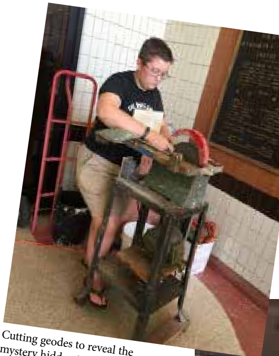
Cutting geodes to reveal the mystery hidden inside