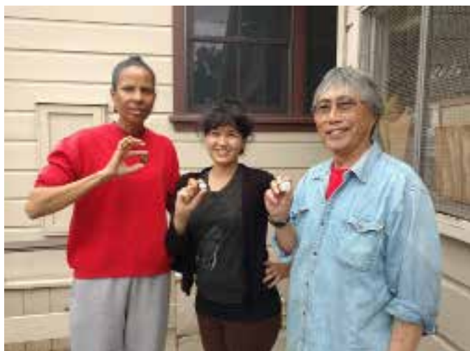
After working through all the steps to create a cabochon, three happy Beginning Lapidary Workshop participants show off their creations