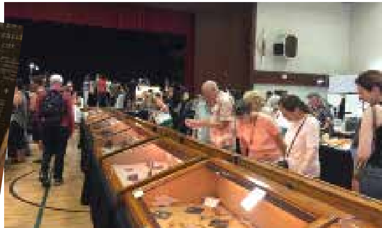
Members' collections and handcrafted creations on display