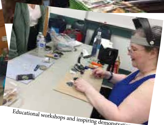
Educational workshops and inspiring demonstrations