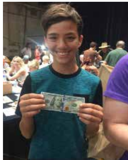
Grand Prize Winner! The picture says it all.