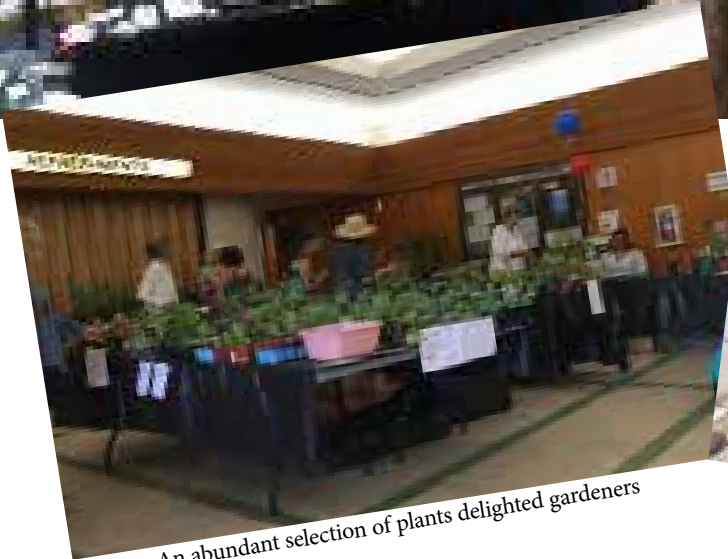
An abundant selection of plants delighted gardeners