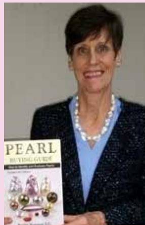
Photos from January's Program on Pearls.