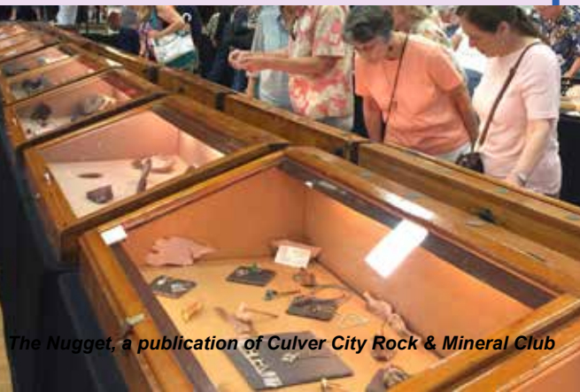
The Nugget, a publication of Culver City Rock & Mineral Club

your display Friday evening or Saturday morning, before the show opens, and pick it up Sunday after the Show closes. Help in setting up your display will be available at the Show. Please sign up at the May or June meetings or contact Steve Dover at skdover@yahoo.com or 310-477-2279 to reserve a case.