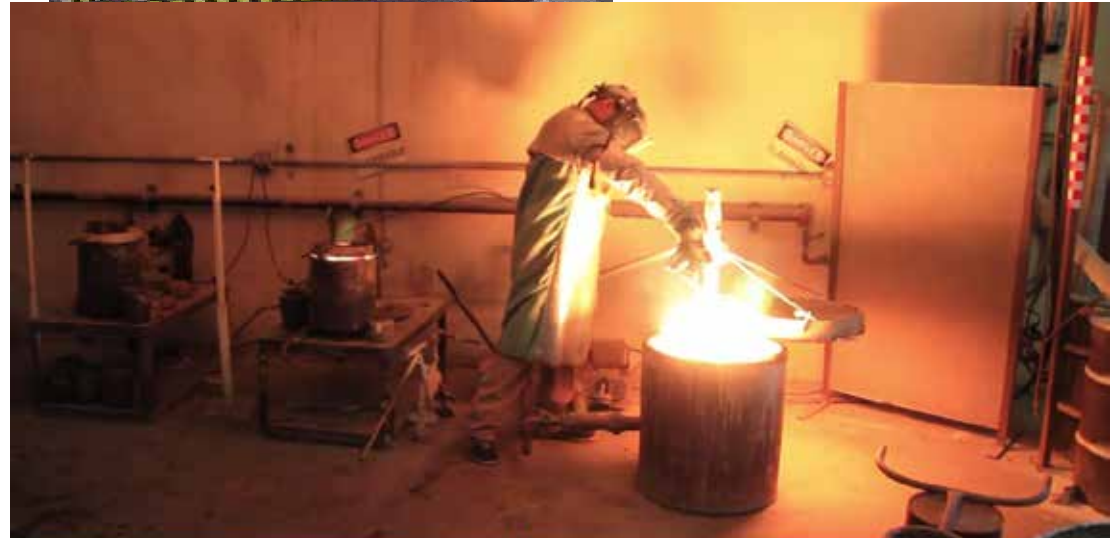
Developing new alloys at Precious Metals West