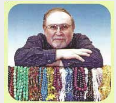
Cover for a beading symposium