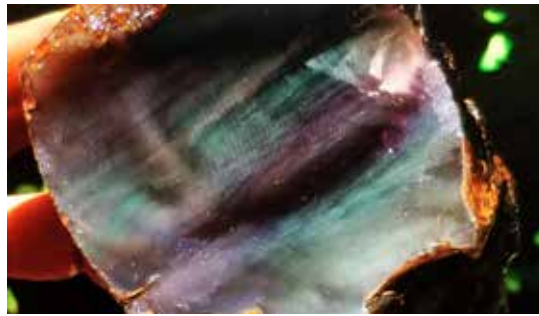
Pink Lady Obsidian