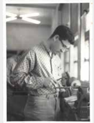
Silversmithing in high school