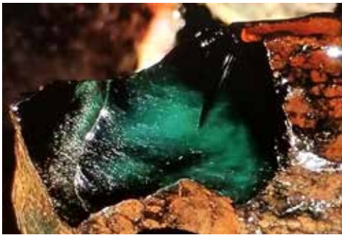
Deep Green Obsidian